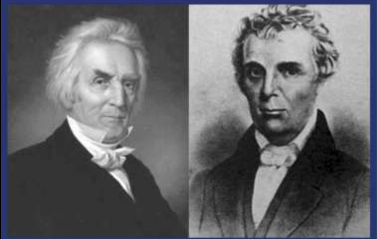
The Mutual Admiration of Barton W. Stone and Alexander Campbell

The American Restoration Movement has a somewhat complex combination of origins, but it is with good reason that priority is often given to the contributions of Barton W. Stone and Alexander Campbell. Stone was chronologically prior to Campbell, but the latter eventually came to be the primary face, thinker, and influencer of the movement. Together, their accomplishments are so recognized that the movement itself is often called, "The Stone-Campbell Movement."